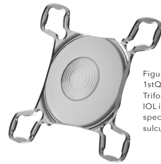
Figure 1. The 1stQ AddOn Trifocal secondary IOL is designed specifically for sulcus implantation.

Post-operatively, uncorrected and best-corrected visual acuities and subjective refraction were assessed. The difference between the predicted residual refraction and actual post-operative refraction was determined as spherical equivalent, residual cylinder and axis. A patient satisfaction questionnaire was completed three months after surgery. The results of my retrospective analysis showed that outcomes between each of the groups were identical, with no loss of best-corrected or uncorrected visual